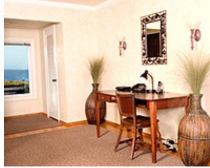
DSL INTERNET ACCESS